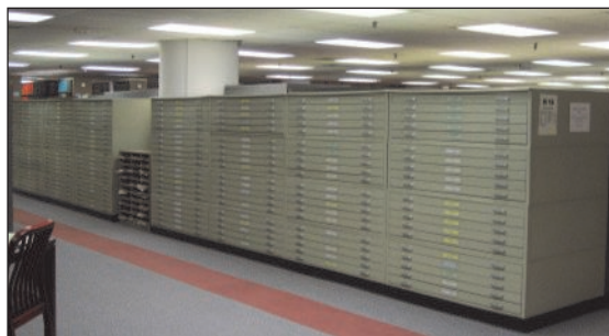
USGS Reston, Map Room

including a tectonic plate map globe with moveable plates, and several metal floor cabinets that house