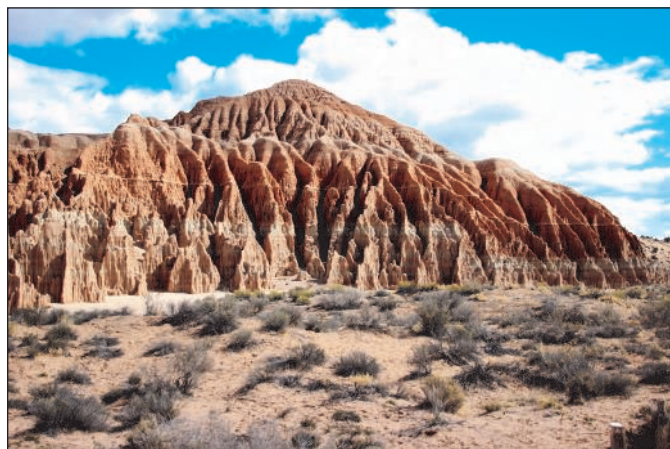
Cathedral Gorge (McGill)

Twenty miles farther north on Highway 93 brought us to Cathedral Gorge State Park. This spectacular formation features a wall of slot