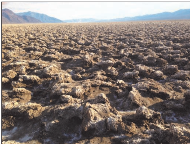
Devils Golf Course in Death Valley (McGill)

And finally, here is an iconic image of Devils Golf Course showing the mottled gypsum, soda ash, and borax deposits on the surface of the ancient lake