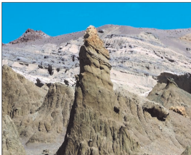
Spiral Hoodoo (McGill)

This area also features the distinctive spiral