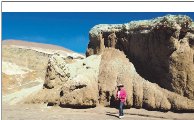
Basin and Range at the Sump (McGill)

This area also features the distinctive spiral