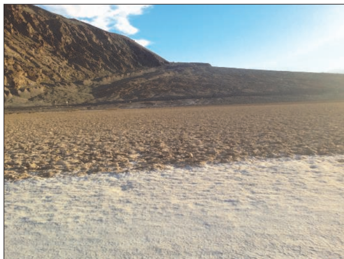
Fault scarp in Death Valley (McGill)

On the west side of the Valley, perhaps 10 miles south of Furnace Creek, we stopped to hike into Artist's Palette, named for the rock faces that have been chemically weathered to produce varied color clays. Note the cross section of the old lake bed sediments close to the bottom: