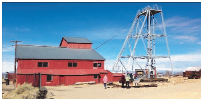
Mizpah Mine at Tonopah

Much of the rich mining history of Nevada is on display in the storied little town of Tonopah. The California Gold Rush of 1849 was long gone when