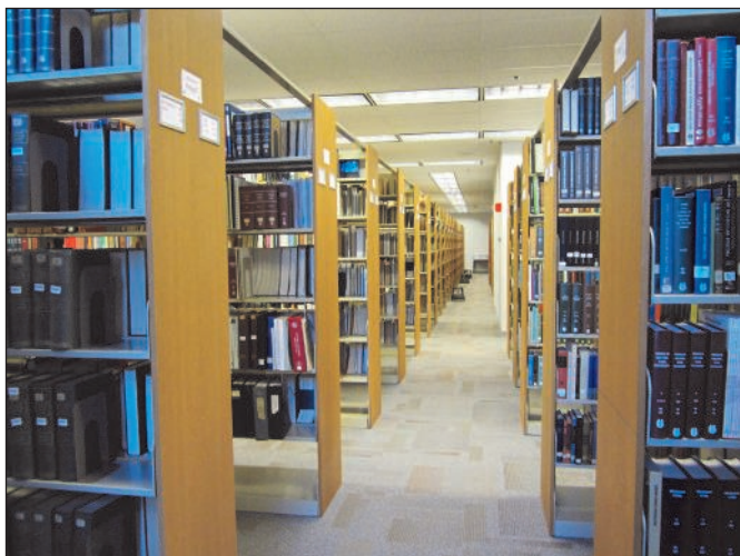
USGS Reston, Library

Many people have visited the Washington D.C. area to see the Smithsonian exhibits, the Lincoln Memorial, or to take in one of the city's well known festivals or events. I would like to add to this list of sites the United States Geological Survey National Center ( http://www.usgs.gov/ ) located in Reston, Virginia.