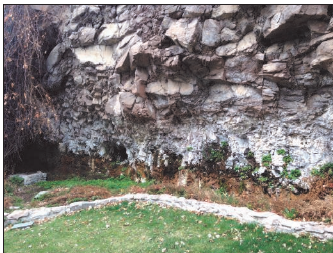
Upside down garden (McGill)

up as a spring. This accounts for the vegetation at the base of the exposure.