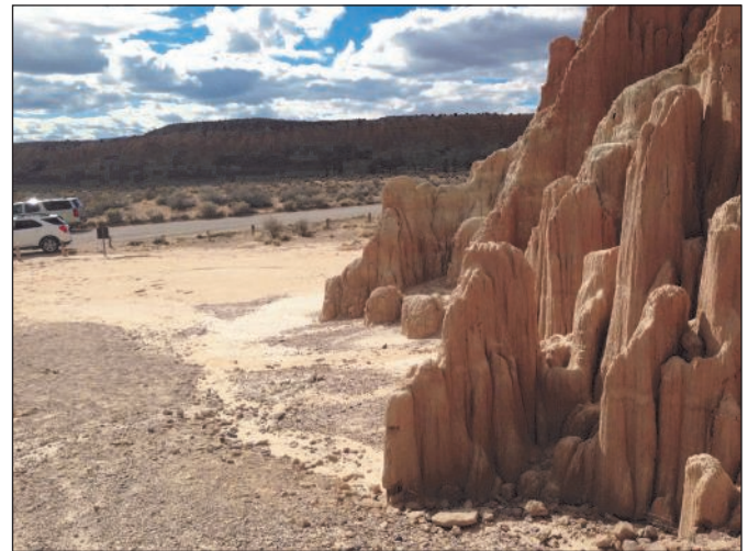
Cathedral Gorge siltstone source (McGill)

canyons carved from 2.5 million year old silt/clay deposits of an ancient lakebed.