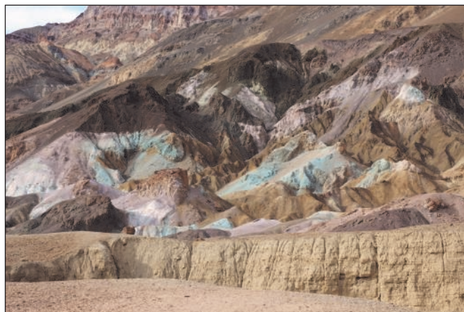
Artist's Palette (McGill)

Finally, we hopped in our vehicles for our last leg of our fantastic journey — west and south through the Rhyolite Ghost Town and up and over the Black Mountains and a descent into Death Valley.