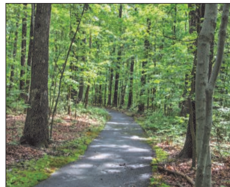
USGS Reston, woods

The United States Geological Survey National Center is open daily from 9:00 a.m. – 4:00 p.m. and proved to be a wonderful side trip. For a few brief moments, I avoided the crowds, the traffic, and the long lines that accompany the other sites in the vicinity, and instead enjoyed some books, art, and solitude.