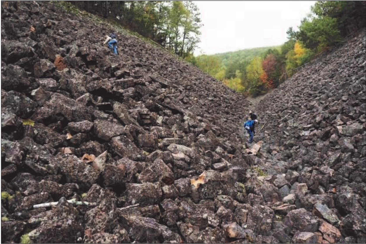
Walking in the Felsenmeer valley