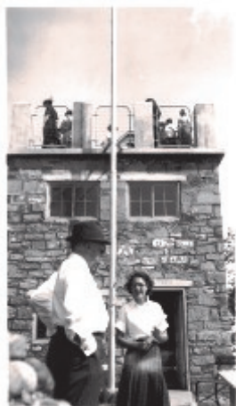
from the archives: A visit to the stone tower, Elk Mound, Wisconsin on a GSM Field Trip to Chippewa Falls, WI, August 1939.