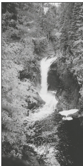
from the archives GSM field trip, North Shore of Lake Superior, Cascade River Falls, July 1940.